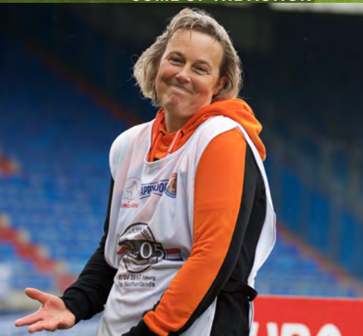
SOME OF THE ACTION