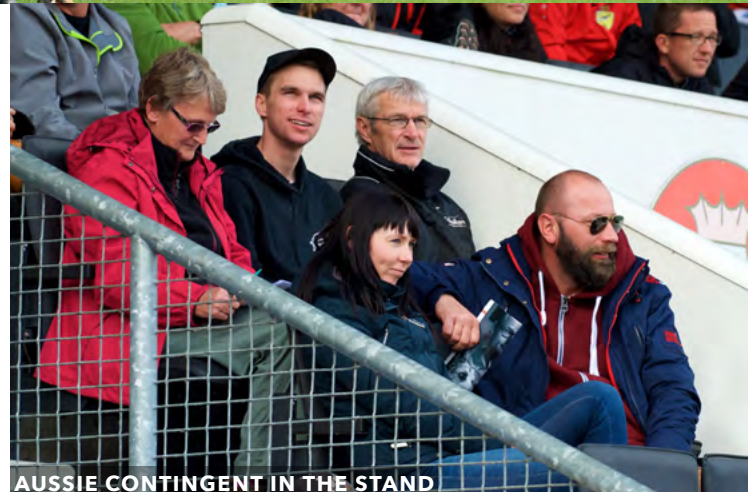
AUSSIE CONTINGENT IN THE STAND

We were a mixed bunch of photographers from Australia, USA, Germany, Holland and the Czech Republic but we all shared the one passion, to capture images of sport dogs having a lot of fun and competing at the highest level. 🐾